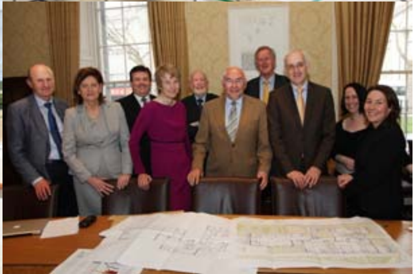
Carlow ETNS new building. Portlaoise ETSN new building, a view of our AGM, Checking out Carrigaline ETNS new building, and signing up to model agreement for Kishoge Community College.