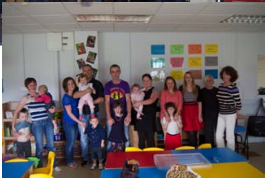
Firhouse ETNS getting ready for the first day