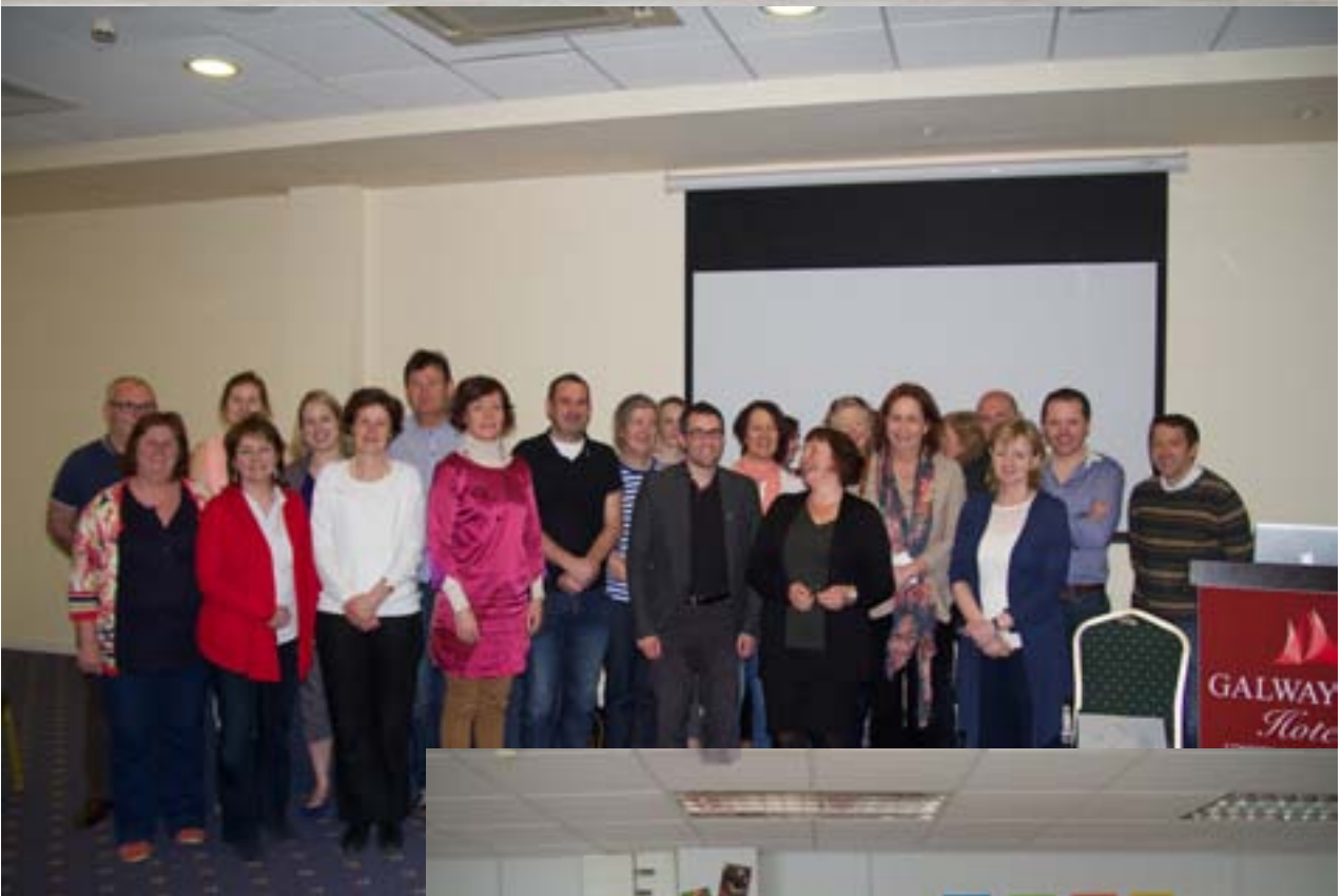
Skerries ETNS new building