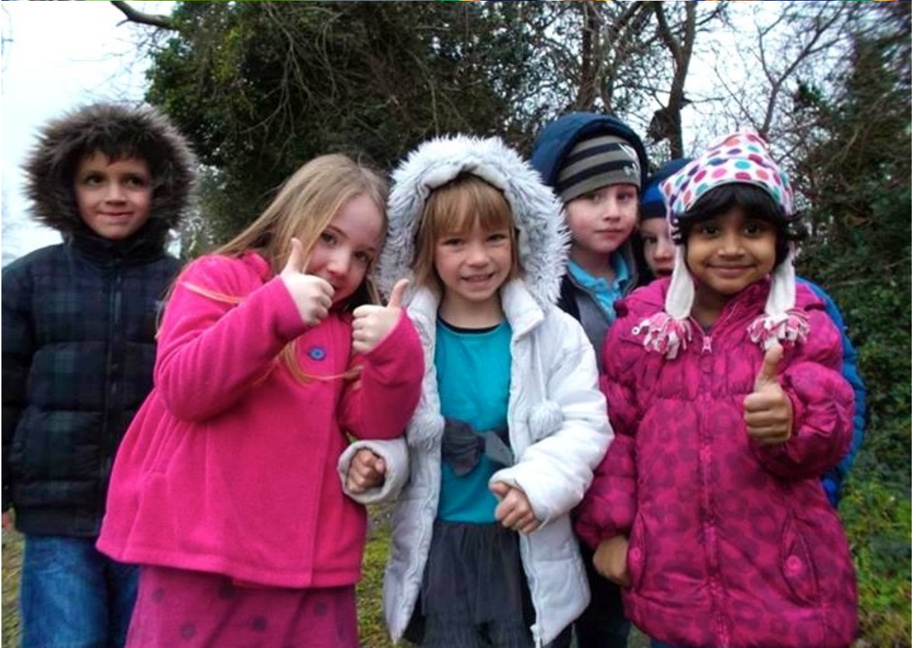
From top: First day at school in the newly opened Portobello ETNS; An artist's impression of the new Hansfield Educate Together Secondary School; The Tyrrelstown ETNS girls relay team celebrating their relay win in style; A fun day out for the students in Stepside ETNS.