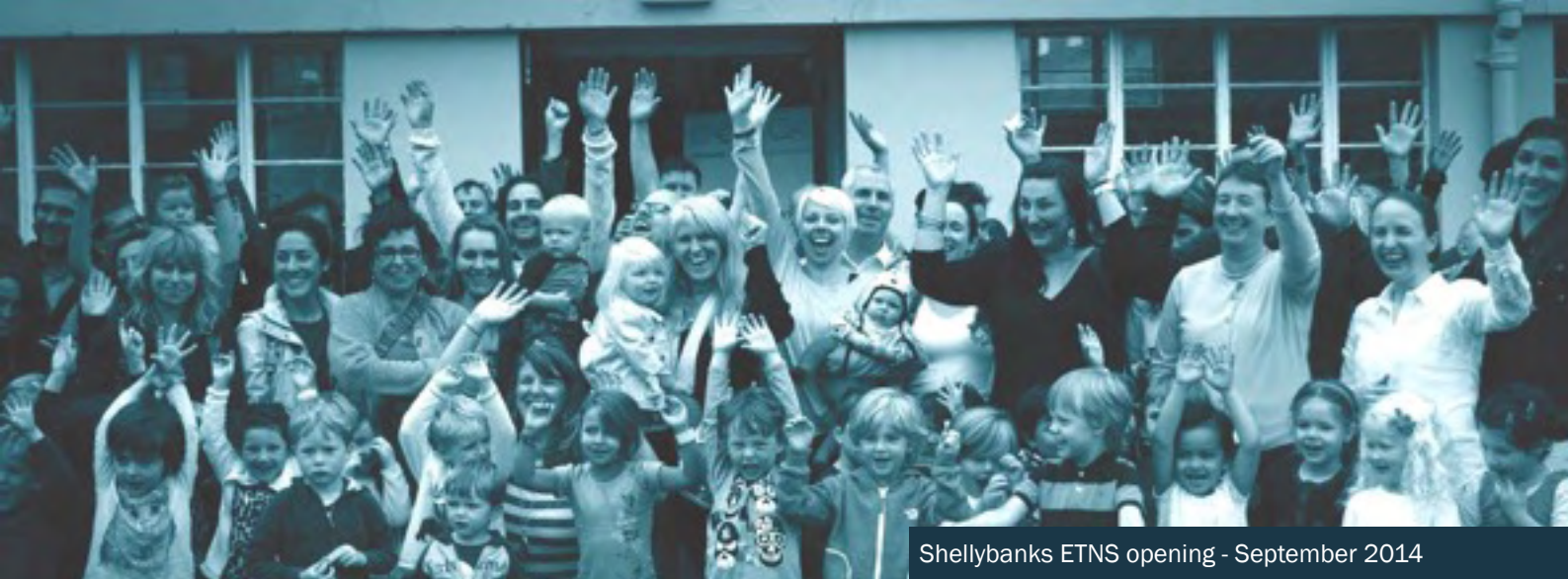
Shellybanks ETNS opening - September 2014