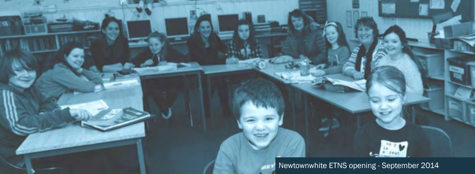
Newtownwhite ETNS opening - September 2014