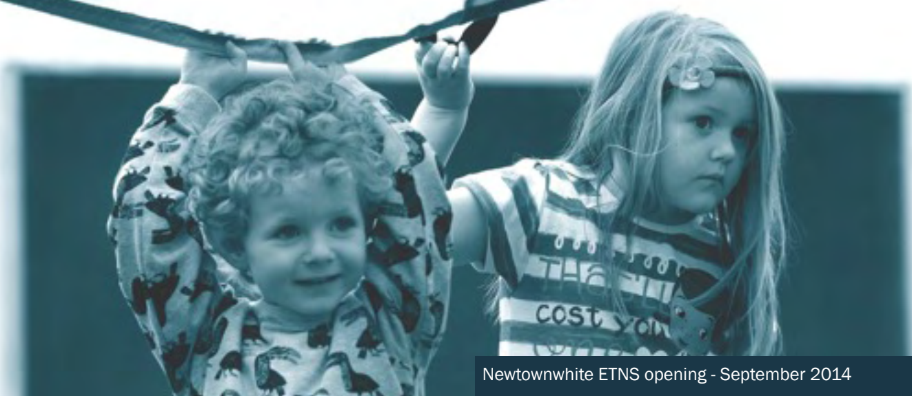
Newtownwhite ETNS opening - September 2014

The second factor affecting the new school process is that new Educate Together schools in areas already identified by the DES for change are only being sanctioned if a premises is made available from an existing patron. The board has the view that the rights of parents in such areas should be vindicated, irrespective of the availability of 'divested' school property. It also has the view that it is essential that new Educate Together schools in such areas must be in locations and in conditions that are viable and attractive to parents.