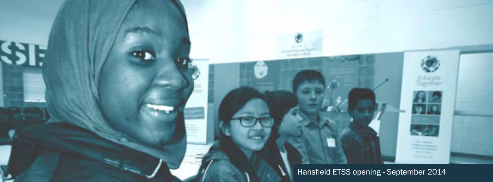
Hansfield ETSS opening - September 2014