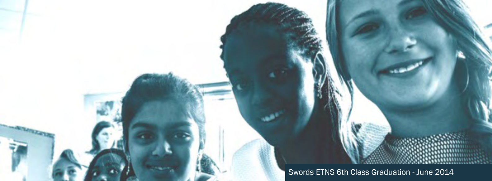
Swords ETNS 6th Class Graduation - June 2014

Many complicated policy issues have been addressed in the development of this work. This has involved much engagement with new second-level partners, management bodies, patrons and staff unions. One area of considerable concern has been the designation of enrolment policies by the DES that seek to impose catchment areas, some of which exclude strong areas of parental support for Educate Together. The board continues to monitor this issue and is committed to ensuring that as many parents who seek this form of second-level education are able to do so.