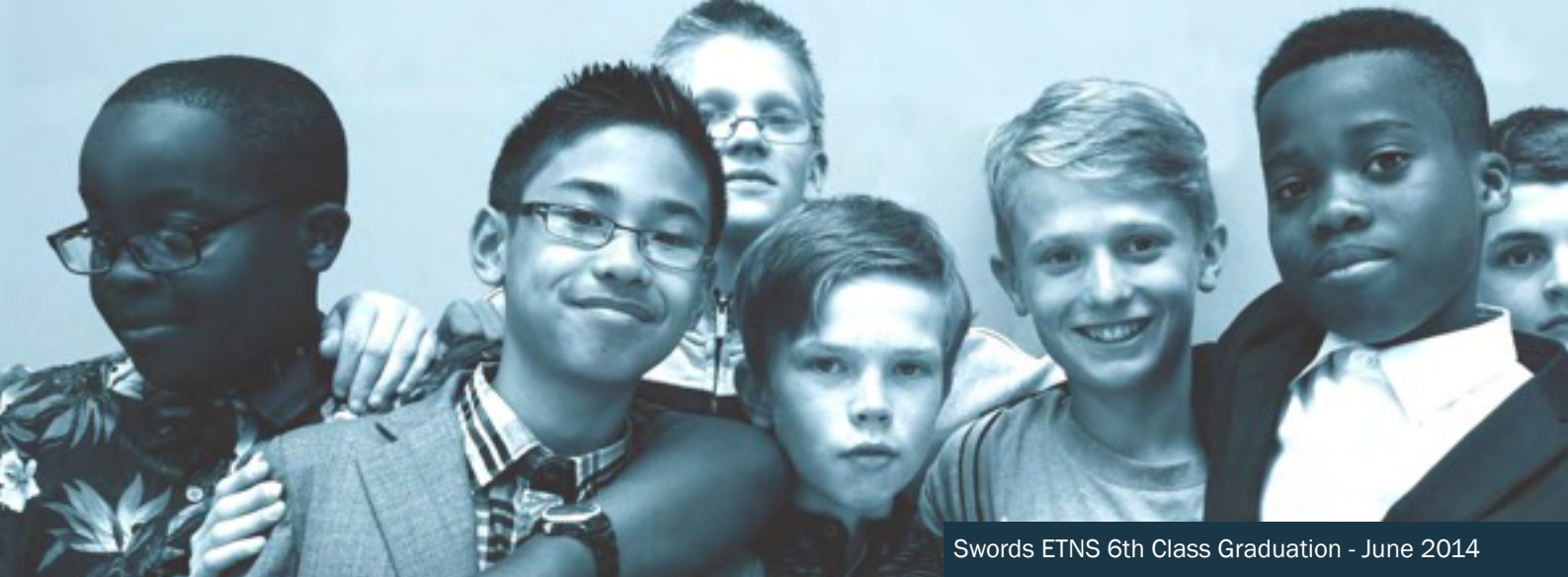
Swords ETNS 6th Class Graduation - June 2014